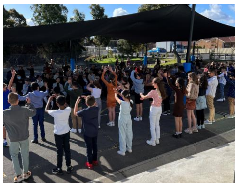
PVSPS students doing their graduation dance

No speaker last week, but the club was very busy. On Tuesday we attended the Fawcner Primary school graduation night, and on Thursday we were at the Pascoe Vale South Primary School, the Pascoe Vale Primary School, the Pascoe Vale North Primary School, and the Coburg North Primary School graduation functions.